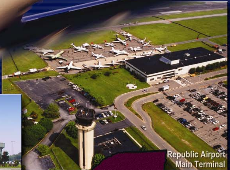
Republic Airport Main Terminal