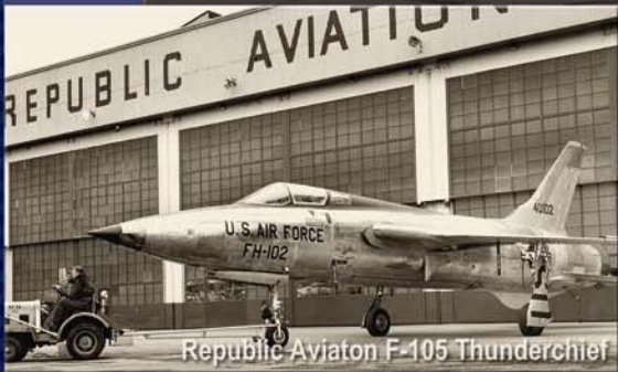
Republic Aviation F-105 Thunderchief