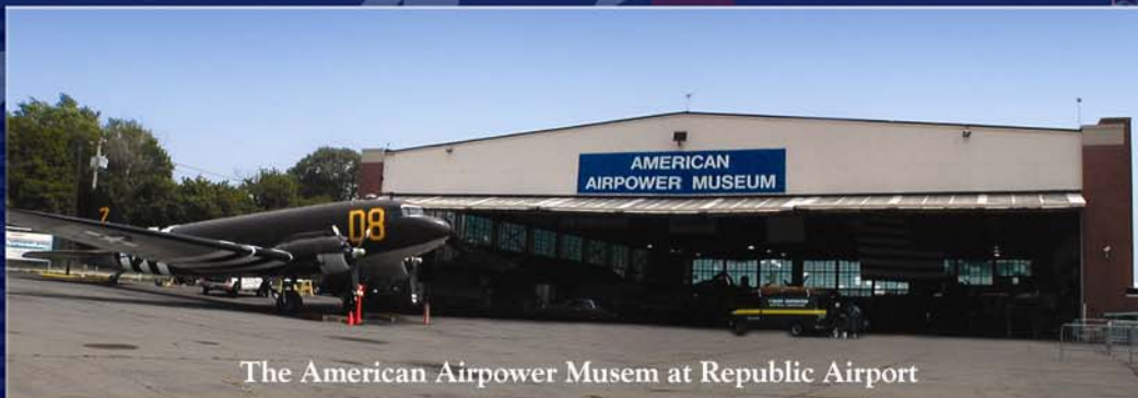
The American Airpower Museum at Republic Airport

* Includes 112 NYS Police jobs and $12.8 million in direct economic output. Total impacts (multiplier effects) of Police jobs include an additional 61 jobs and $6.1 million in output.