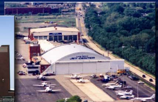
Long Island Jet Center