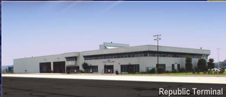
Republic Terminal Airfield View